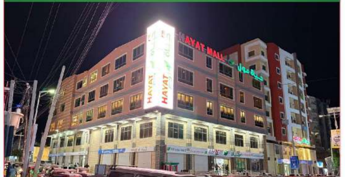
HAYAT MARKET – KM4 TALEEH (2022)