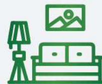
Home & Living