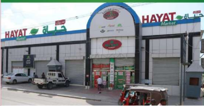
HAYAT MARKET – KM5 ZOPE (2020)