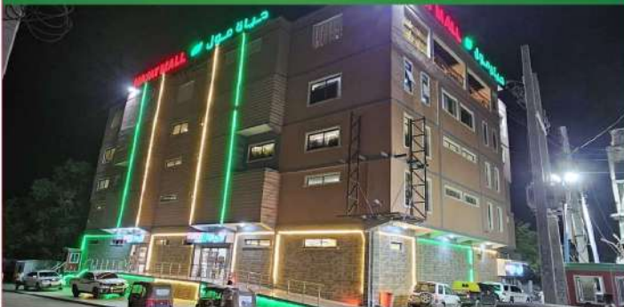
HAYAT MARKET – BOONDHERE (2023)