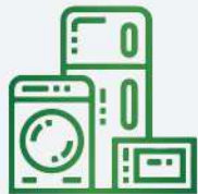
Electronics & Appliances