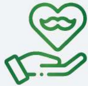
Health & Beauty