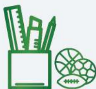
Sports & Stationery