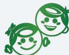
Baby & Kids