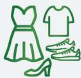
Clothing , Footwear & Fashion